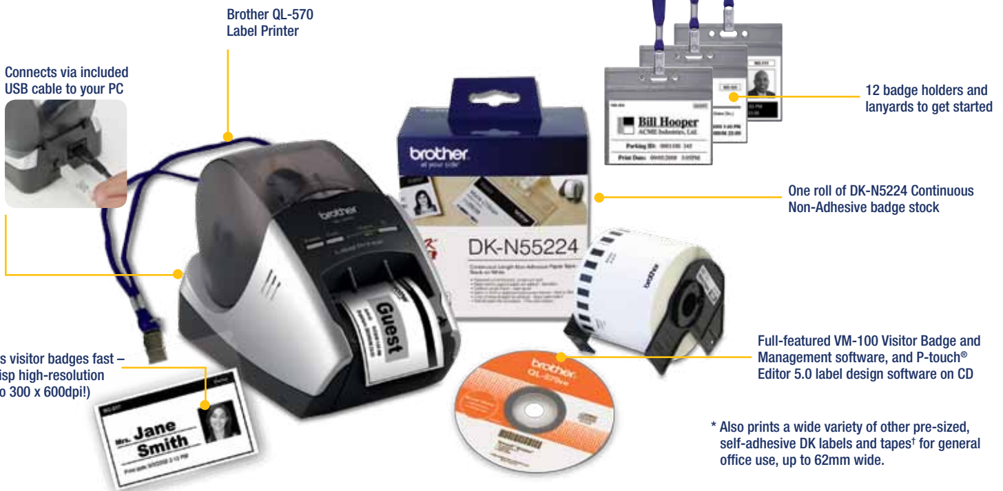
Brother QL-570 Label Printer

Connects via included USB cable to your PC