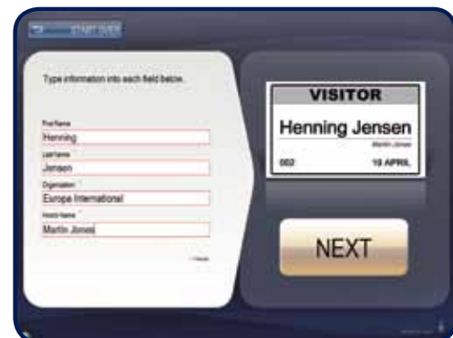
Self Check-in mode

For assisted check-in used by most organizations. Visitors arrive and someone on your staff – typically at the front desk or reception area – enters their data to generate a badge.