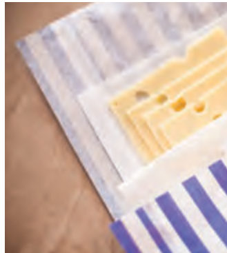
Ensure the safety of your customers with clear 'Use By' labels