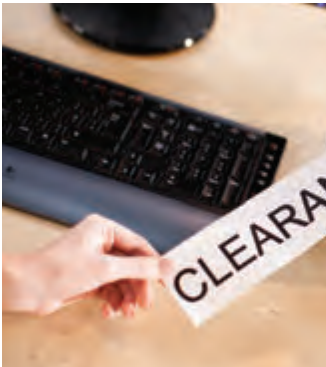
The continuous roll offers the ability to create larger signage

Increase productivity & efficiency by enabling busy retail workers to print a wide range of labels on the shop floor by incorporating TD-2000 with a trolley/mobile workstation. With its compact design, the TD-2000 is also ideal to use on crowded retail desktops and counters without sacrificing valuable workspace for a standard sized desktop printer. Sharp text, logos and barcodes printed quickly on high quality Brother media can help contribute to enhanced customer satisfaction at the counter or check out.