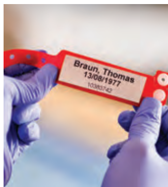
Print basic patient details when required