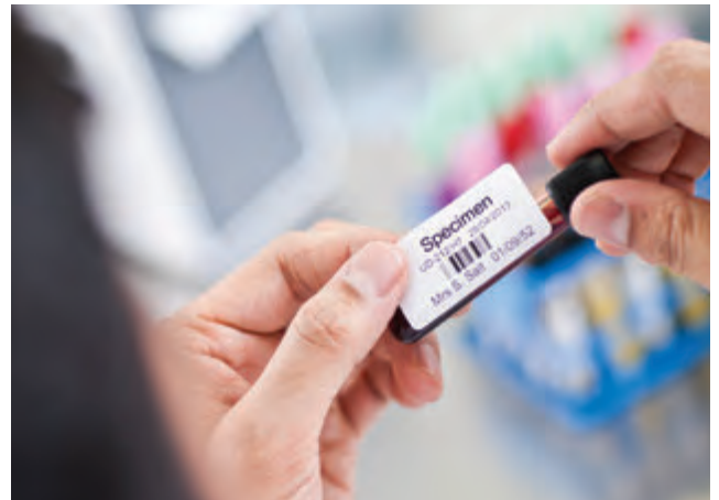
Simply apply your custom designed label

Support for ZPL® applications without extra development costs. Simply connect the TD-2000 and adjust the built-in settings to whatever your system requires.