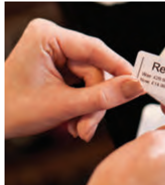
Push through slow moving stock by creating sales labels whilst on the move in store