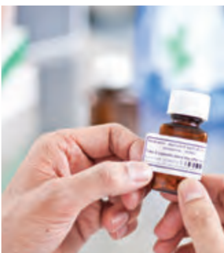
Label sizes can be adjusted to fit different sized tablet containers

The network model (TD-2120N) provide healthcare workers with the option of wirelessly printing a variety of barcode labels quickly and whenever needed in the laboratory, pharmacy, front desk or even at the patient's bedside. With support for the most common barcode protocols, all models are ideally suited to any labelling task in healthcare.