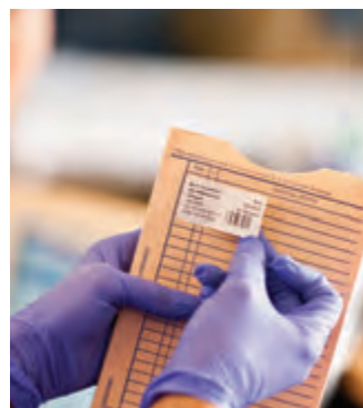
Locate patients' records and other important documentation quickly with an identification label