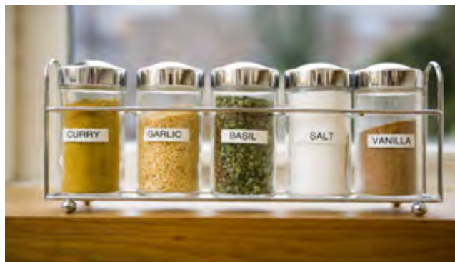
Many different types of labels can be printed with the TD-2000 series

Brother RD labels also contain no Bisphenol-A, a common chemical used in the manufacture of inferior labels. As such, Brother RD labels are safe to use in the food industry, and also pose no hazard to the health of infants and young children.