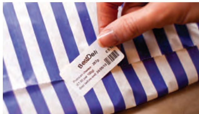
The adhesive used in Brother RD rolls has been certified safe for food labelling