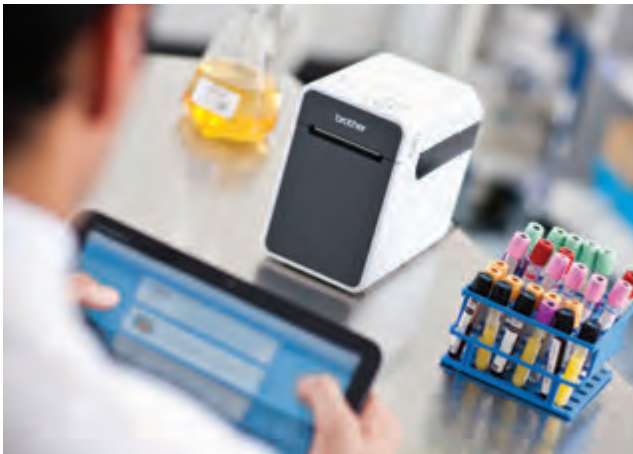
Increased freedom and mobility - print wirelessly from virtually any tablet or handheld device