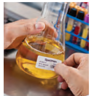
Ensure that patients' samples are clearly and correctly identified